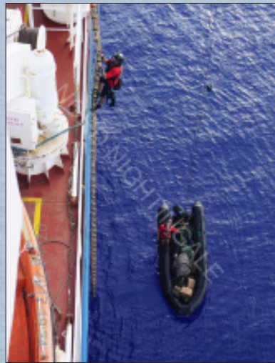
Above: Pararescuemen with the 308th Rescue Squadron board the Nord Nightingale, a commercial tanker at the scene, July 7, 2017 and prepare to hoist their inflatable rescue boat, known as a Random Alternate Method Zodiac, onto the ship. Below: Pararescuemen tend to the survivors and prepare to move them from their raft onto a rescue boat.