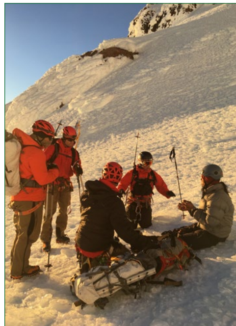
Guardian Angel Reserve Citizen Airmen with the 304th Rescue Squadron, Portland, Oregon, tend to a distressed climber Feb. 13, 2018 located about 10,500 feet up Oregon's tallest mountain.

Tech. Sgt. Lindsey Maurice 920th Rescue Wing Public Affairs