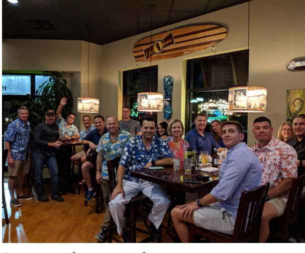
Strategic Alignment planning.