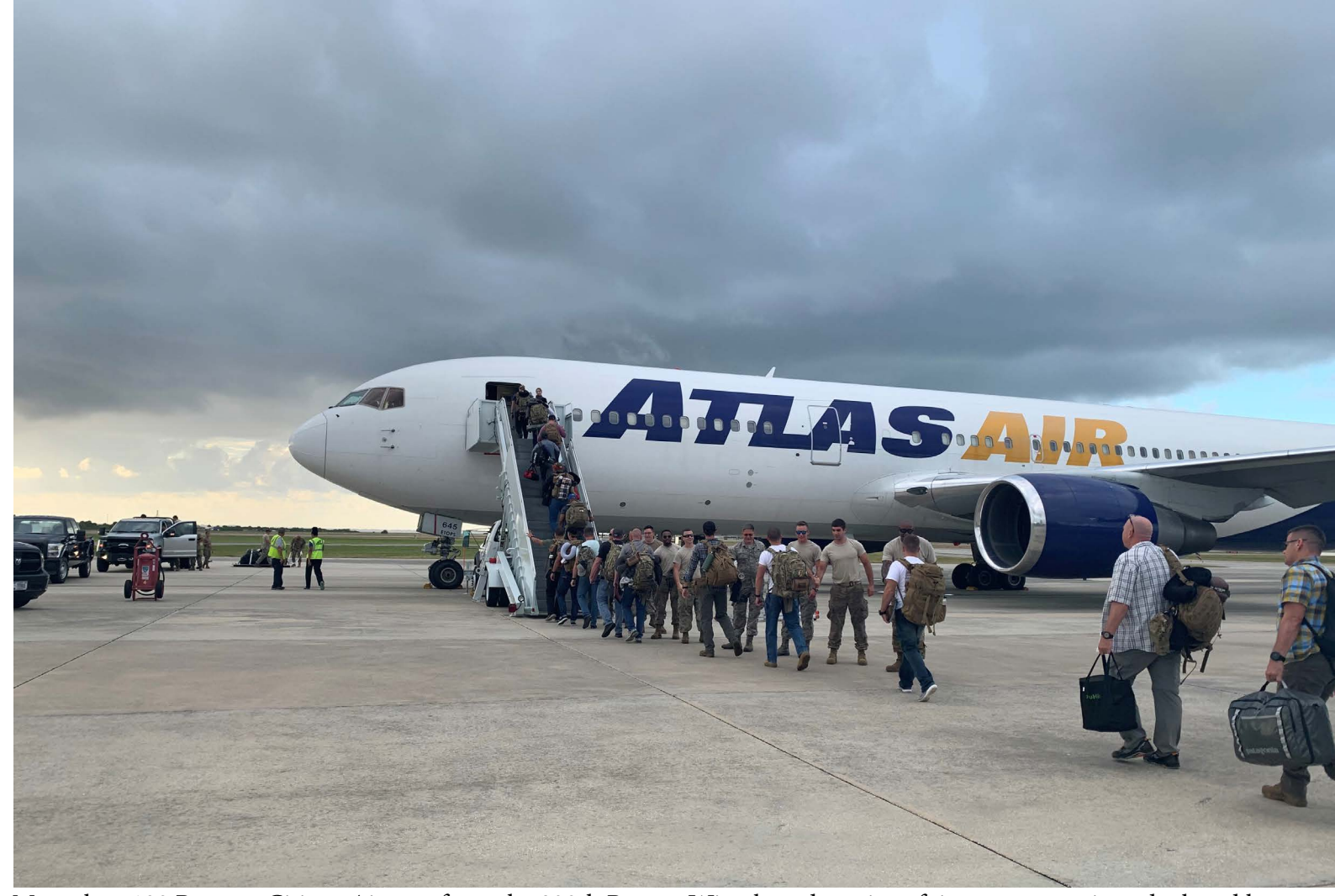
More than 100 Reserve Citizen Airmen from the 920th Rescue Wing board an aircraft in route to various deployed locations in support of operations in the Middle East and the Horn of Africa, September 28, 2019, at Patrick Air Force Base Florida.